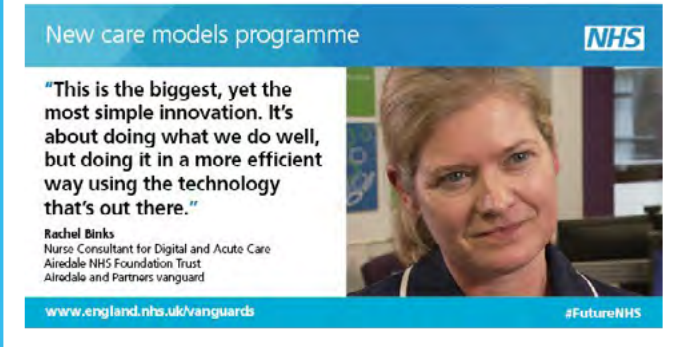
Supporting NHS England and the wider family of new care models on social media