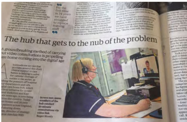
Featuring in The Guardian as part of a supplement looking at nursing innovation