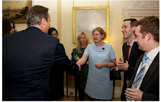
Sharing our telemedicine experiences with former Prime Minister David Cameron at 10 Downing Street